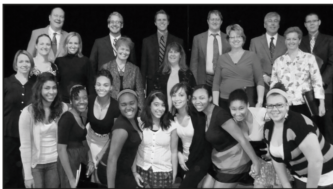
2013 TTAP Participants

Through the generous support of corporate, foundation and individual donors, VocalEssence offers the program free of charge.