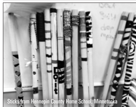
Sticks from Hennepin County Home School, Minnetonka