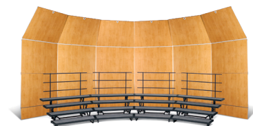
Legacy® Acoustical Shell and Signature® Choral Risers - beautiful, portable, sturdy

Acoustic Products Audience Seating Conductor's Equipment Music Chairs Music Stands Choral Risers Seated Risers Staging & Platforms Sound Isolation Solutions Storage Products Teaching Tools and More!