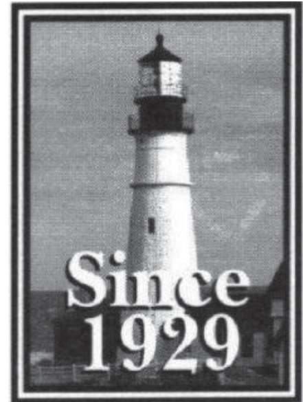
Hallie Q. Brown Community Center