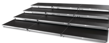
StageTek™ Risers - easy to assemble, unlimited configurations, non-slip surface