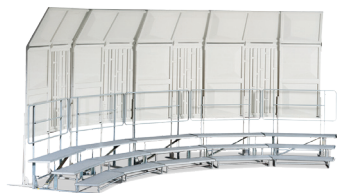
Travelmaster™ Portable Shell and Tourmaster® Choral Risers - lightweight and transportable